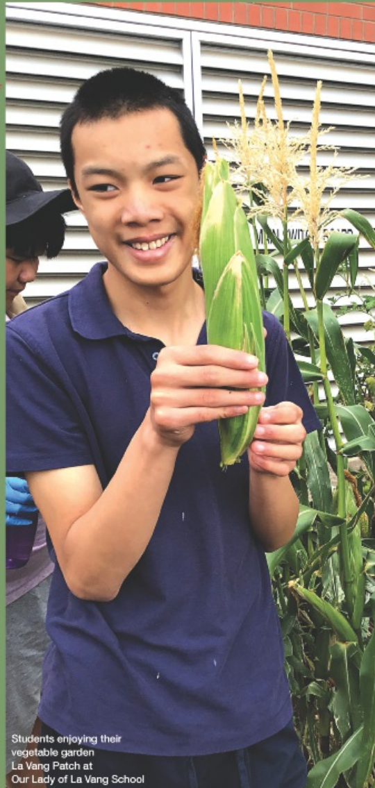
Students enjoying their vegetable garden La Vang Patch at Our Lady of La Vang School

Make a donation online at www.adelaide.catholic.org.au or scan the QR code